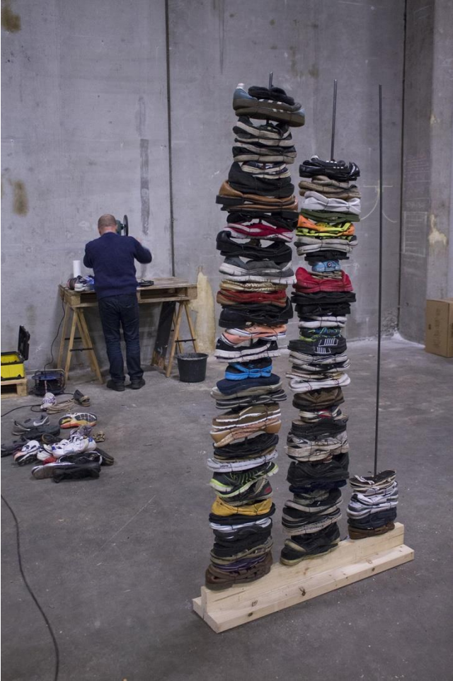
Work in process October 2017